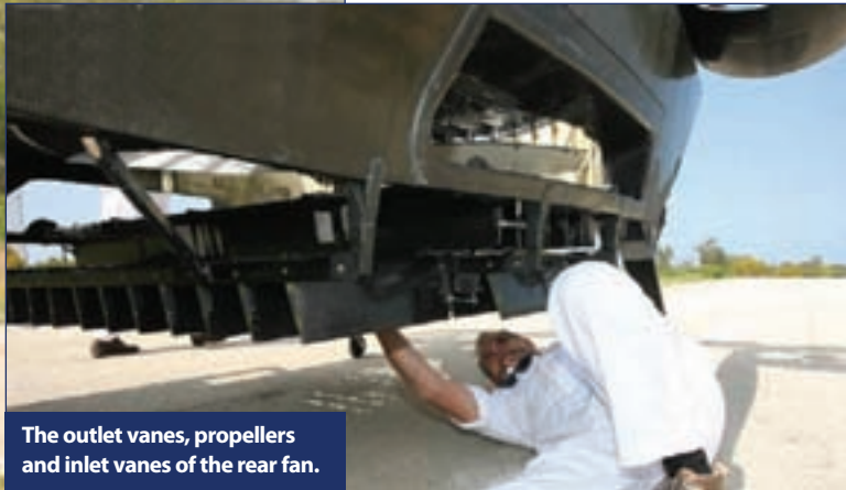
The outlet vanes, propellers and inlet vanes of the rear fan.

Helicopters are vulnerable to small arms fire and MANPADS, and are increasingly expensive to operate, to the point where they are becoming inefficient for certain tasks. This is particularly evident when it comes to transporting payloads in the sub-500kg category. It is simply not efficient to employ a CH-47 or UH-60 for small payloads over short ranges, especially in terms of available crew flying hours.