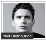
The Franco Phenomenon