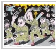
Coup de disgrace