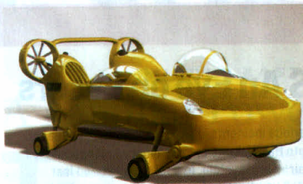
QUICK TO THE RESCUE: The X-Hawk chopper