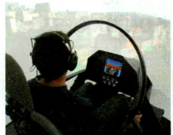
X-Hawk is set for first flight in 2009

Israeli company is pursuing a military version with Bell Helicopter and Penn State University in the USA, and is also studying an unmanned version called the Mule for combat-zone supply and medical evacuation missions. The Mule would be 25% smaller than the X-Hawk with a maximum take-off weight of 1,090kg (2,400lb) and a payload of 454kg.